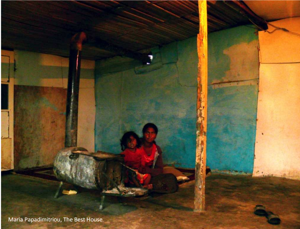
Maria Papadimitriou, The Best House

The presence of Roma people in cities seems to have become an open and problematic issue especially in Italian and European chronicles. Except in rare cases, Roma people are seen more and more as a thorny and controversial presence; the feeling of rejection that falls on “other” people is ever stronger. Most of Roma population lives in extreme poverty and degradation, apart from the rest of society and physically separated: in some areas they are isolated, due to the lack of minimum infrastructures. They occupy “nowhere places” - abandoned buildings or unplanted areas by the roadside - from which they are too often cleared out without any policy of real support or effort towards integration on the part of public administrations in search of consensus. The result is a vicious circle, which removes the “problem” on the surface without searching for any lasting solutions.